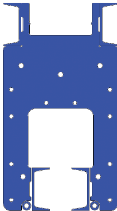
3500 Series 6" Channel