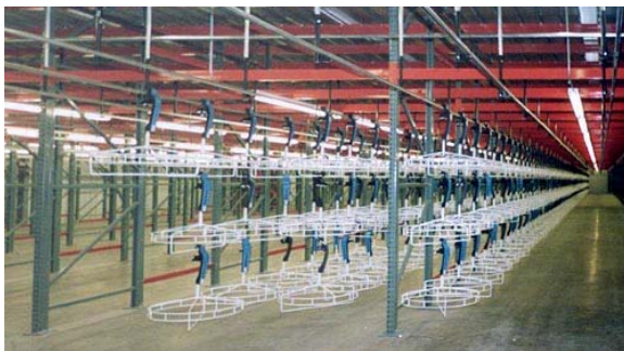
Empty carriers are consolidated and stored, awaiting receipt of new garments

The addressable trolleys and the ability to automatically travel to a particular storage lane have made IntelliTrak the best choice for those distribution center applications where significant labor cost reductions are important.