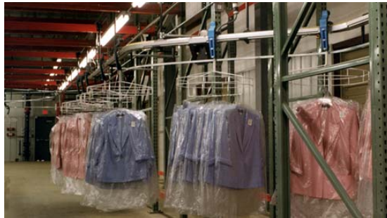
Loaded carriers move throughout the system in a clean, quiet, inherently safe manner.