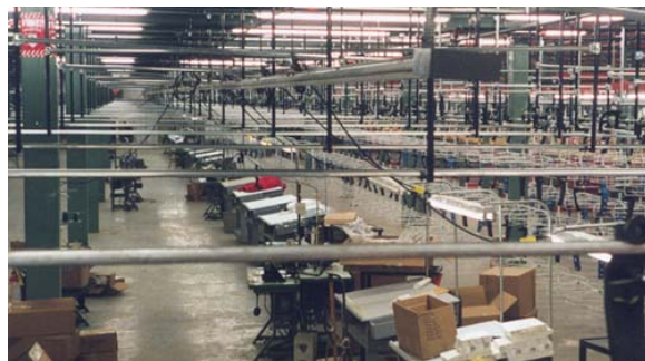
Orders are picked, inspected, and dispatched directly to shipping.